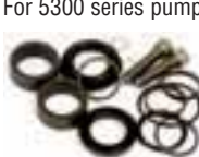
Piston Repair Kit