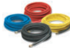
High-pressure hoses from 30 to 150-ft. lengths