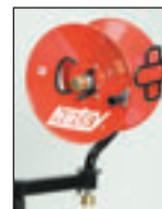
360° Pivot and non-pivot hose reels