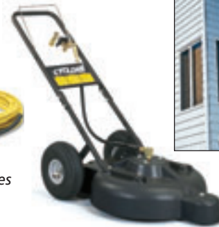
Rotary surface cleaner attaches to your pressure washer