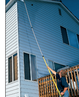
Heavy-duty, highpressure hoses in