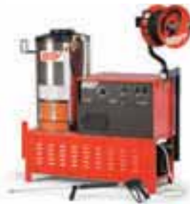
Model 1412SS (Shown with optional hose reel. Portability not available on gas fired models)

The 1400 Series packs the biggest punch of Hotsy's portable, electric-powered hot water pressure washers with a cleaning force of 3.9 GPM and 3000 PSI. Powered by a 7.5 HP, 1725 RPM or 8.2 HP, 3450 RPM Baldor motor with 24 configurations, including portable and stationary models, the 1400 series offers hours of non-stop heavy-duty cleaning of everything from trucks to heavy equipment. Besides its ruggedness, the 1400 series is also ETL certified to the rigid UL-1776 safety standards. All models come standard with a stainless steel coil skin.