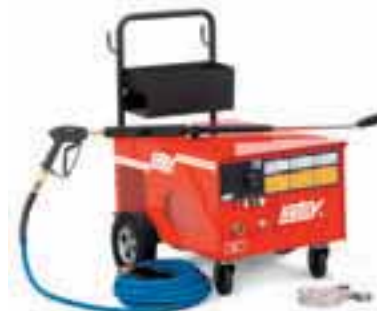
Model 1710 shown with optional wheel kit (PN 280700).