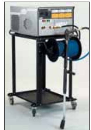
1700 Series shown with optional hose reel kit, (PN 280704), cart (PN 280702), caster wheel kit (PN 280703) and stainless steel base and cover (PN 280711).