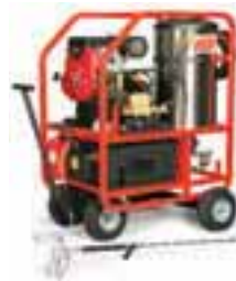
1270SS Shown with optional Portagear Kit