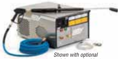
Shown with optional stainless steel cabinet

The 1700 Series offers the most reliable stationary, electric-powered, cold water pressure washer featuring a Hotsy belt-drive pump with 7-year warranty, insulated variable pressure wand and ETL safety certification.