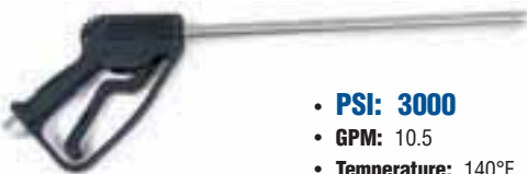
AP Single Lance Dump Gun