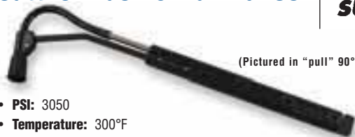
(Pictured in "pull" 90° position)