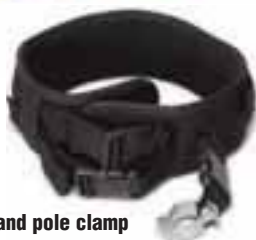
Belt and pole clamp